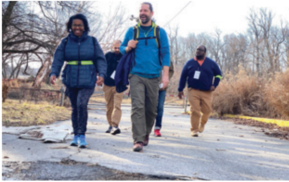
Walk participants on the city's western border