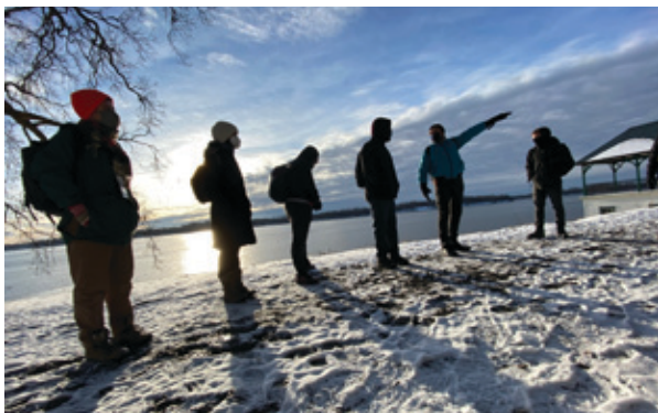
February 2021 Walk participants navigate snow and ice