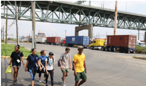
Exploring perimeter in S. Philadelphia industrial zone