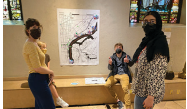
Recent walk retreat participants w/ walk segment map