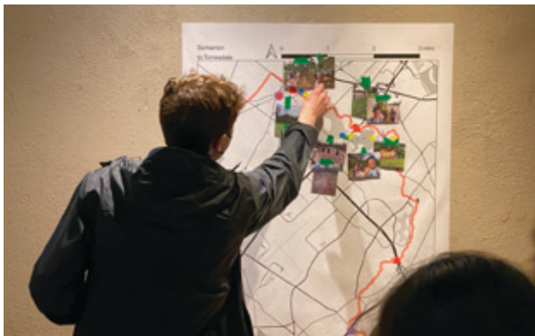
Walk retreat participants annotate segment map