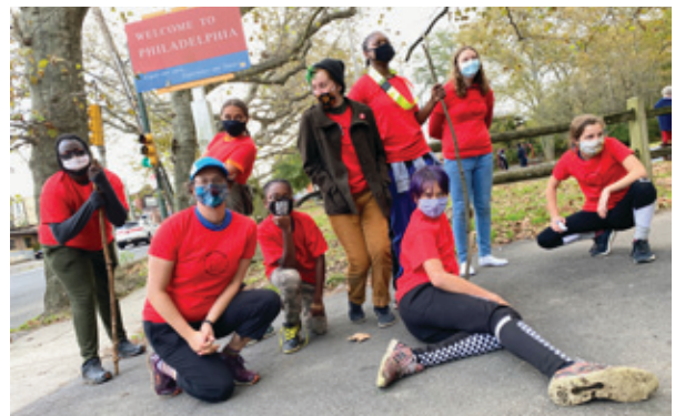
High School students completed entire perimeter