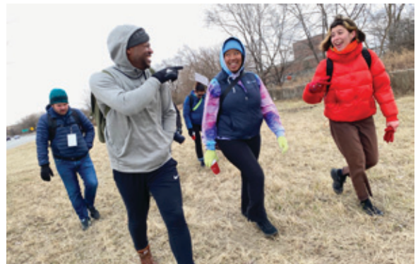
Walkers bond after crossing of the Platt Bridge on foot