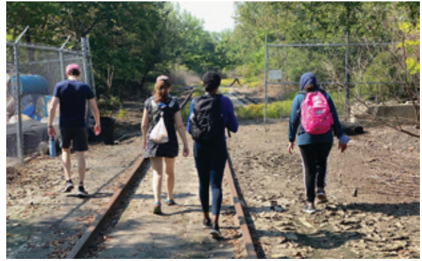
Walk Around Philadelphia group in Bridesburg